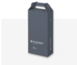
Floor care kit MODCAREKITECO