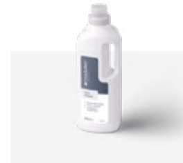
Floor Cleaner1 L MODCLEANECO1000