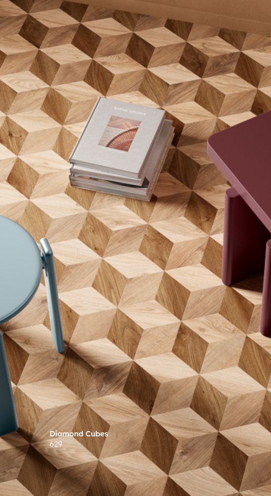
Diamond Cubes 629