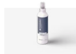
Spot Cleaner250 ML MODSPOTCLEAN